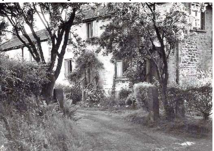
The cottages in Church Gates

(Legend has it that the Ribble valley was dedicated to St. Leonard, which may explain the string of churches named for him along its length ).